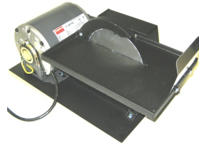
Model "JM" with Motor shown

INSTRUCTIONS: MACHINE MAY BE MOUNTED ON A TABLE, WORK BENCH OR ON A PIECE OF HEAVY PLYWOOD IF PORTABILITY IS DESIRED. FASTEN SECURELY WITH BOLTS OR SCREWS. TO INSTALL DIAMOND SAW BLADE, REMOVE HEX NUT (LEFT HAND THREAD). PLACE BLADE BETWEEN FLANGES AND TIGHTEN NUT. THE MOTOR MAY BE MOUNTED BEHIND OR BELOW THE MACHINE. WHEN USING A REGULAR BLADE, IF MOTOR IS 1725/1750 RPM , USE A 2" PULLEY ON THE MOTOR SHAFT. FOR HI-SPEED FACETERS THIN BLADE, USE A 4" PULLEY ON THE MOTOR. IF MOTOR SPEED IS 3450 RPM, USE EITHER A 1-1/2" OR 2" PULLEY FOR REGULAR AND HIGH SPEED. SMALLER DIAMETER BLADES MAY BE USED WITH A MOTOR PULLEY SIZED TO OBTAIN PROPER S.F.P.M., FOLLOW BLADE MANUFACTURES RECOMMENDATION.